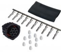
D11868 CONN - AMP connector 7-way female connector repair kit