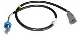
R12931 FCP - DT wiring for number plate lamp 1200mm