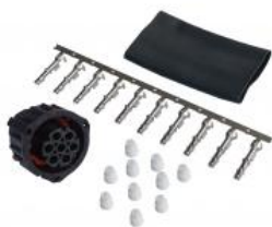
D11868 CONN - AMP connector 7-way female connector repair kit