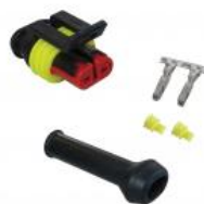
D13880 CONN - SUPERSEAL 2 way female connector repair kit