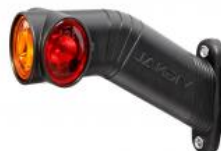
D14425 FA3 LED - Left End outline marker lamp LED 12/24V cristal...