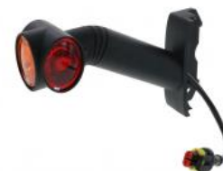
D14781 FA3 LC12 LED - End outline marker lamp LED left side 12/24V...