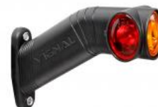
D14426 FA3 LED - Right End outline marker lamp LED 12/24V...