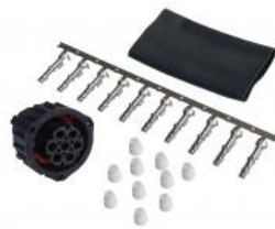
D11868 CONN - AMP connector 7-way female connector repair kit