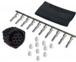
D11868 CONN - AMP connector 7-way female connector repair kit