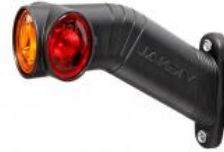
D14425 FA3 LED - Left End outline marker lamp LED 12/24V cristal...