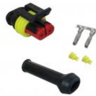
D13880 CONN - SUPERSEAL 2 way female connector repair kit