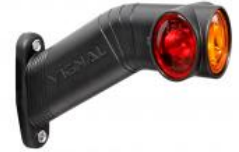
D14426 FA3 LED - Right End outline marker lamp LED 12/24V...