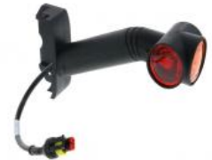
D14782 FA3 LC12 LED - End outline marker lamp LED right side 12/24V...