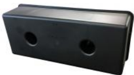
D14721 COVER - Protective cover for rear lamp's connector