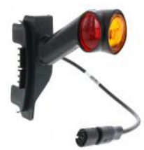
D12711 DXLC8 - End outline marker lamp Bulbs 12/24V cristal +...