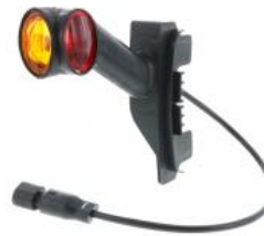
D12712 DXLC8 - End outline marker lamp Bulbs 12/24V cristal +...