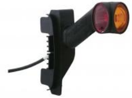
D14037 DXLC8 - End outline marker lamp LED 12/24V cristal +...