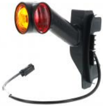
D13034 DXLC8 - End outline marker lamp Bulbs 12/24V cristal +...