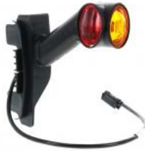
D13035 DXLC8 - End outline marker lamp Bulbs 12/24V cristal +...