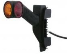
D14038 DXLC8 - End outline marker lamp LED 12/24V cristal +...