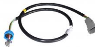
R12934 FCP - DT wiring for number plate lamp 600mm