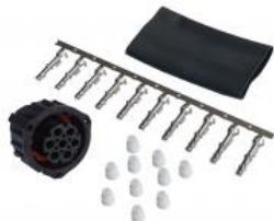
D11868 CONN - AMP connector 7-way female connector repair kit